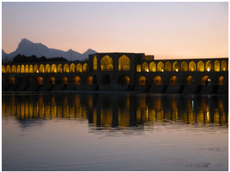
Bridge over the Zayandeh River, Esfahan

This morning you will be driven to the airport, from where you will fly back to London.